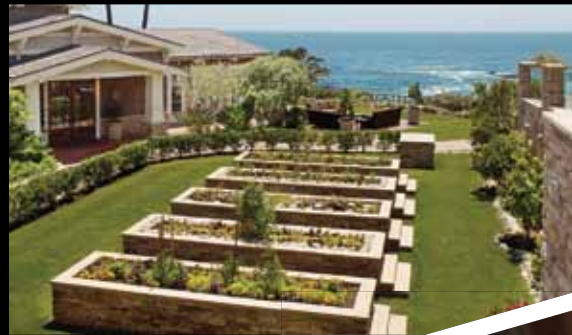
Montage Laguna Beach Studio Garden overlooking the Pacific Ocean